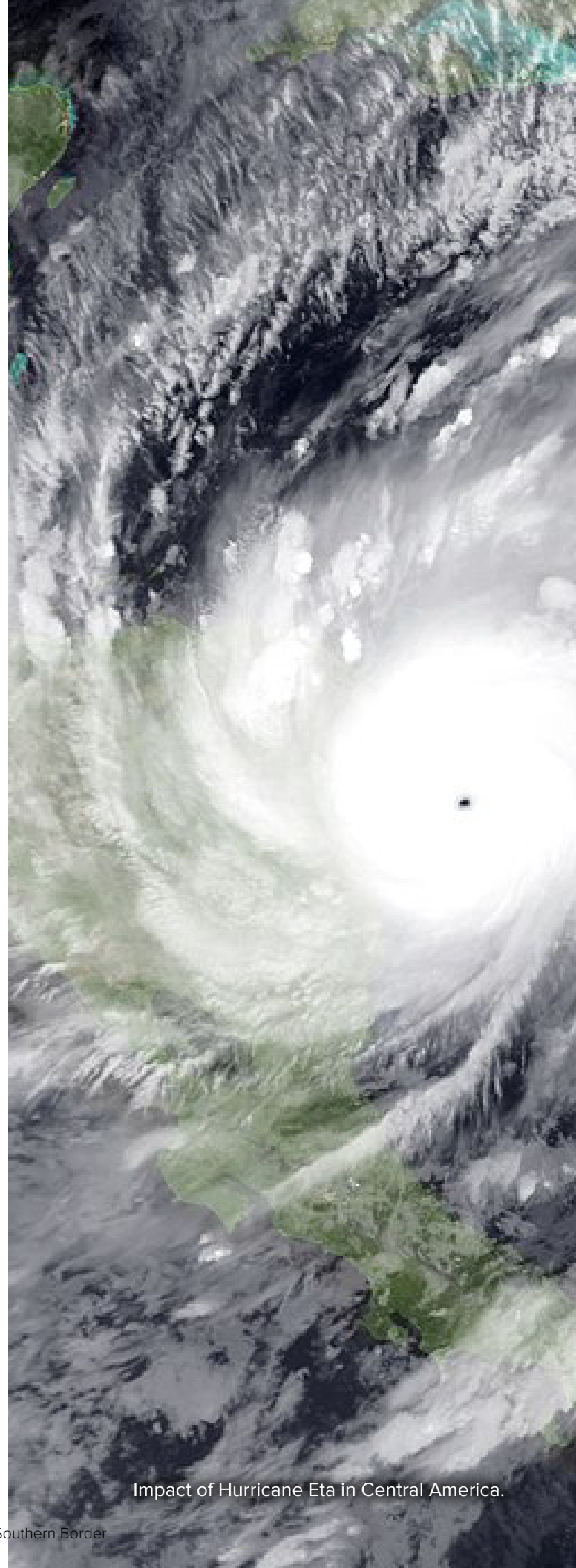
Impact of Hurricane Eta in Central America.

Like many participants, she noted changes in the climate and weather of the region, including more extreme fluctuations in precipitation and hotter temperatures.