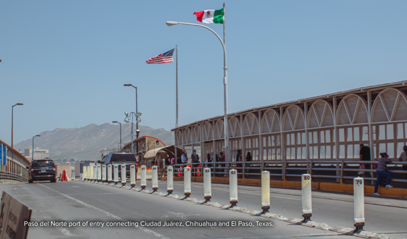
Paso del Norte port of entry connecting Ciudad Juárez, Chihuahua and El Paso, Texas.