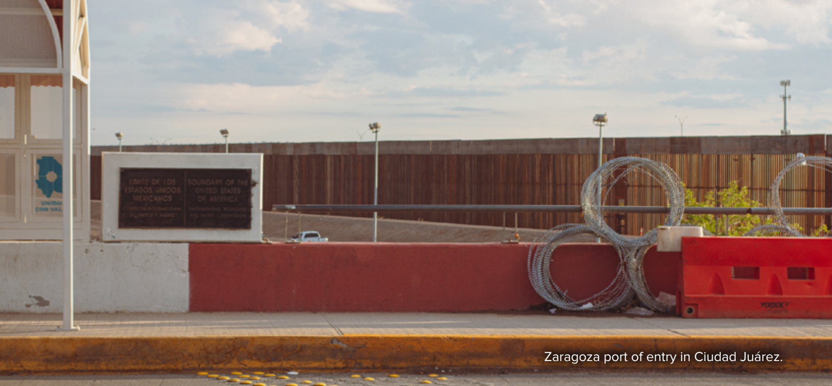
Zaragoza port of entry in Ciudad Juárez.