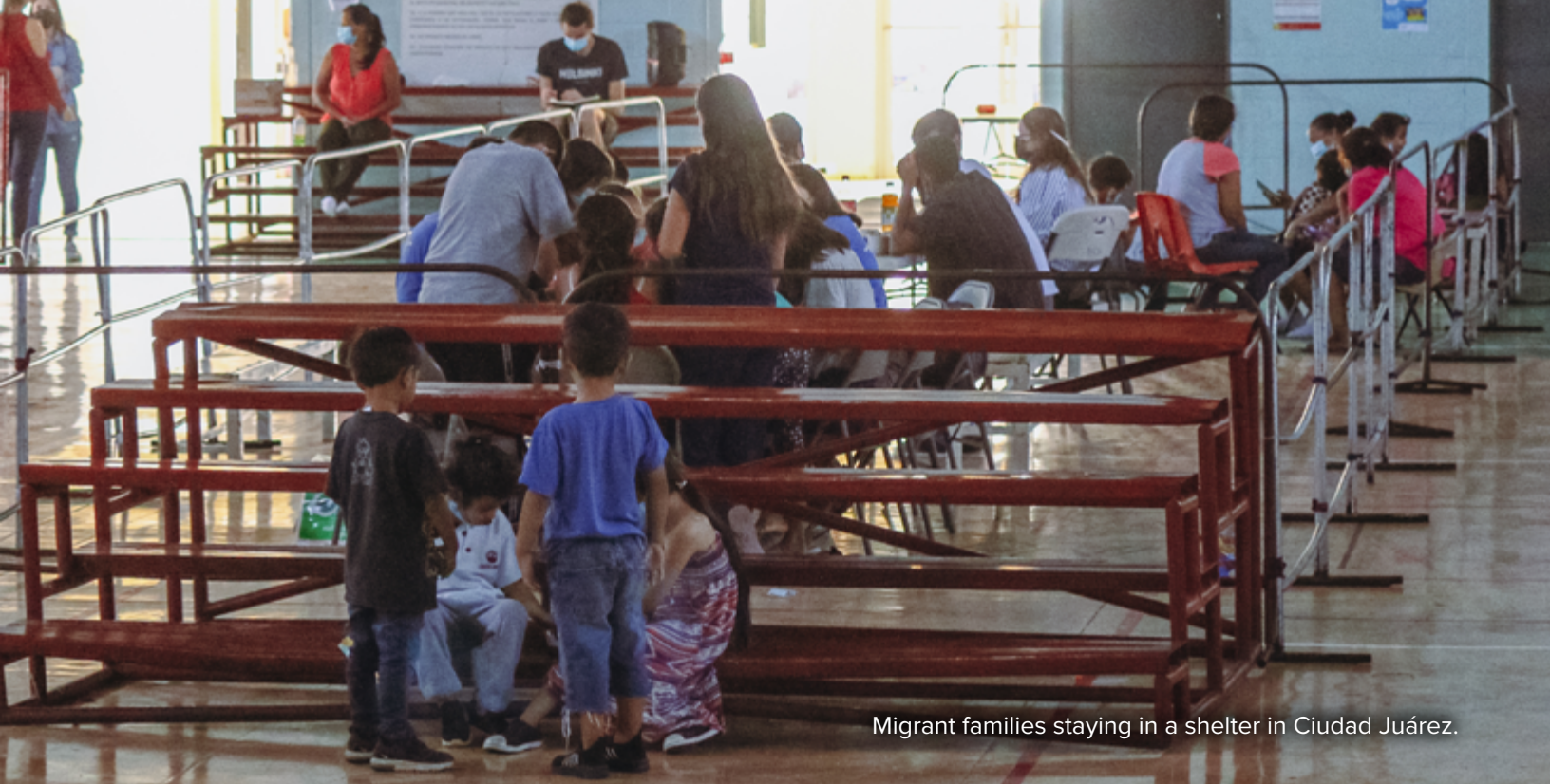
Migrant families staying in a shelter in Ciudad Juárez.