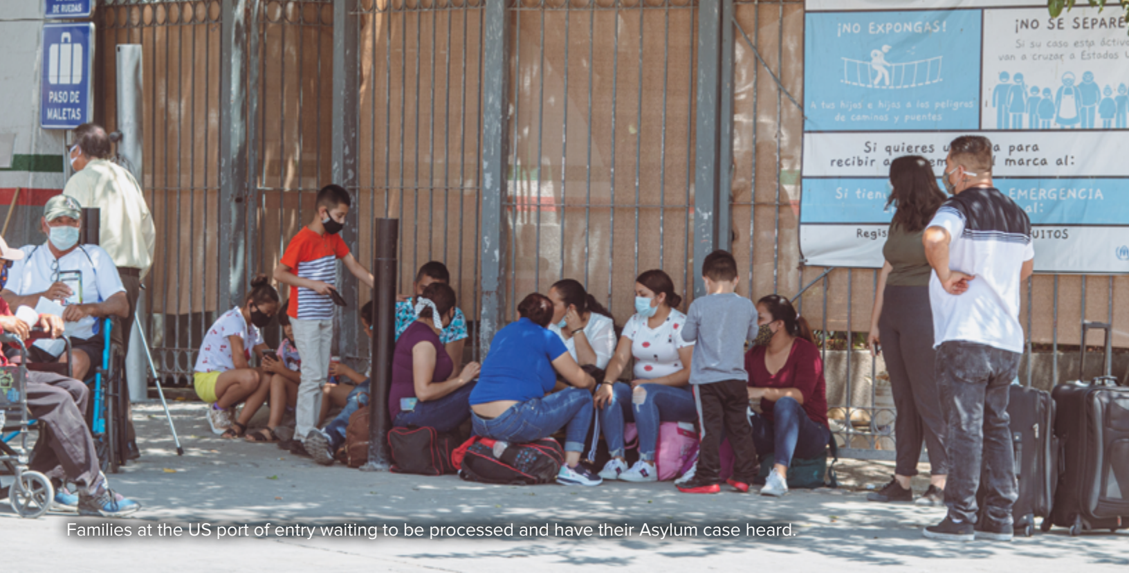
Families at the US port of entry waiting to be processed and have their Asylum case heard.