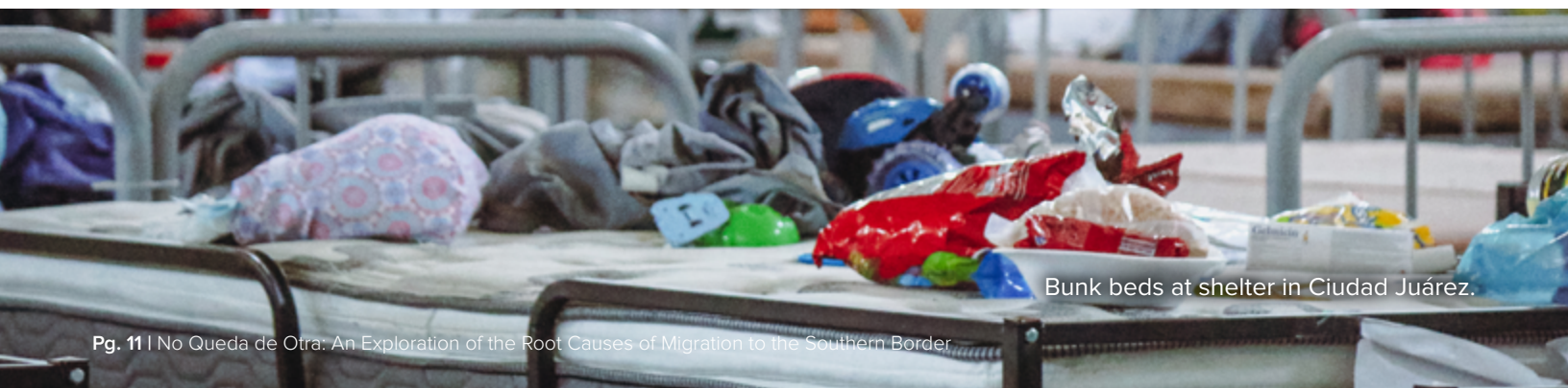
Bunk beds at shelter in Ciudad Juárez.