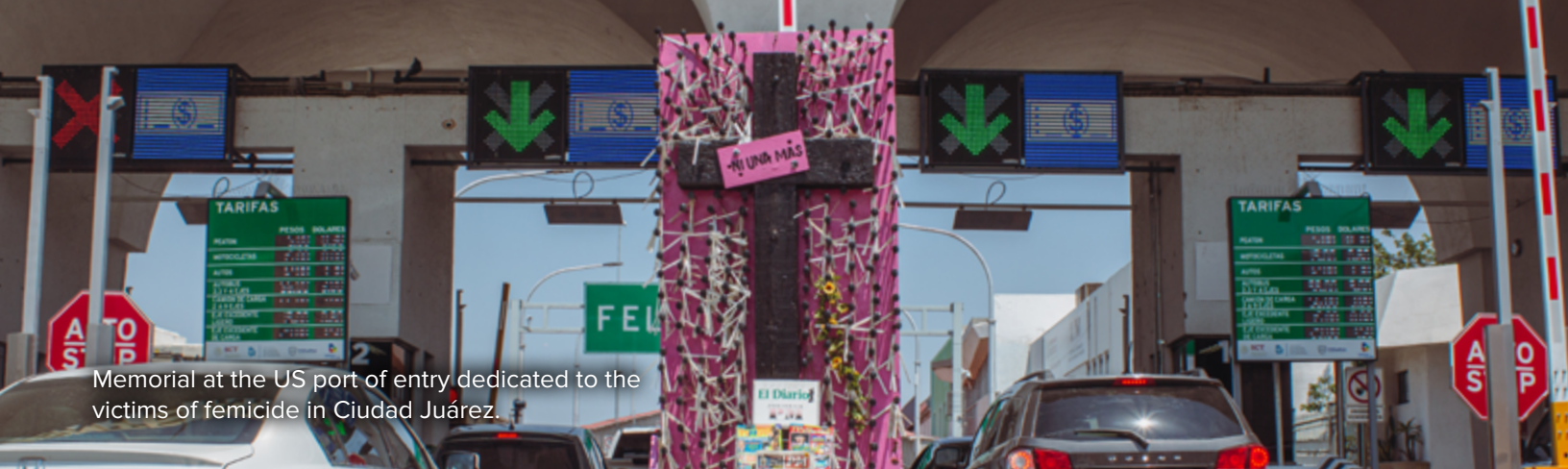
Memorial at the US port of entry dedicated to the victims of femicide in Ciudad Juárez.