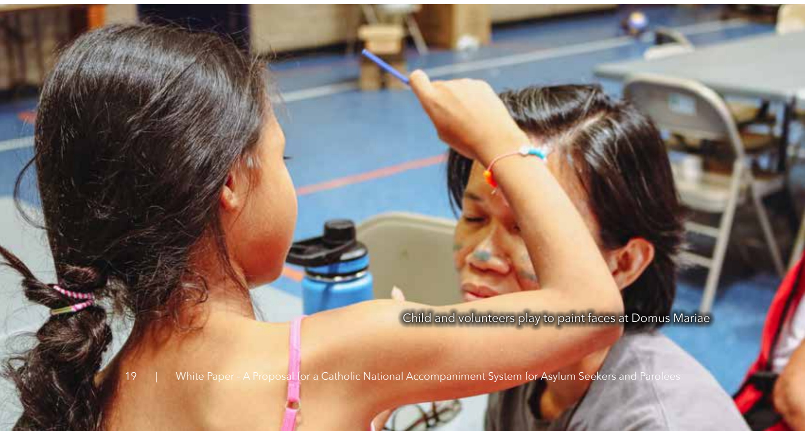
Child and volunteers play to paint faces at Domus Mariae