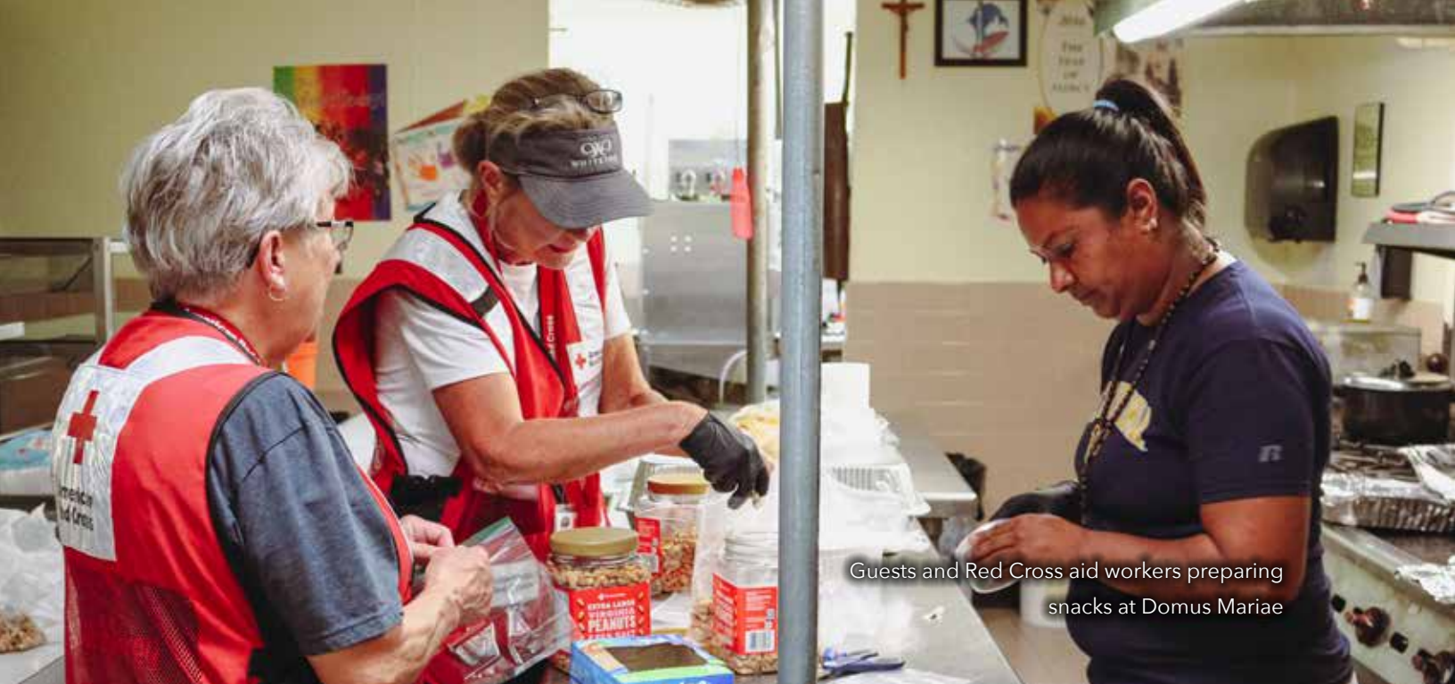
Guests and Red Cross aid workers preparing snacks at Domus Mariae