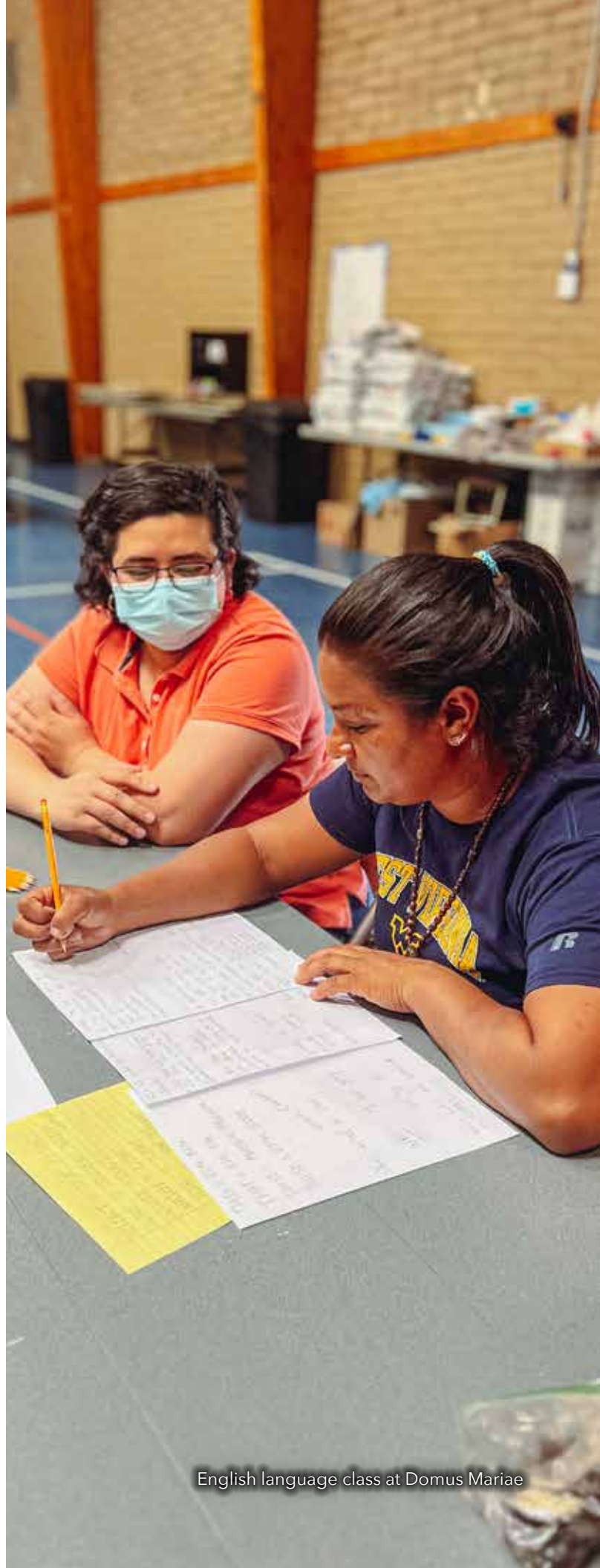
English language class at Domus Mariae