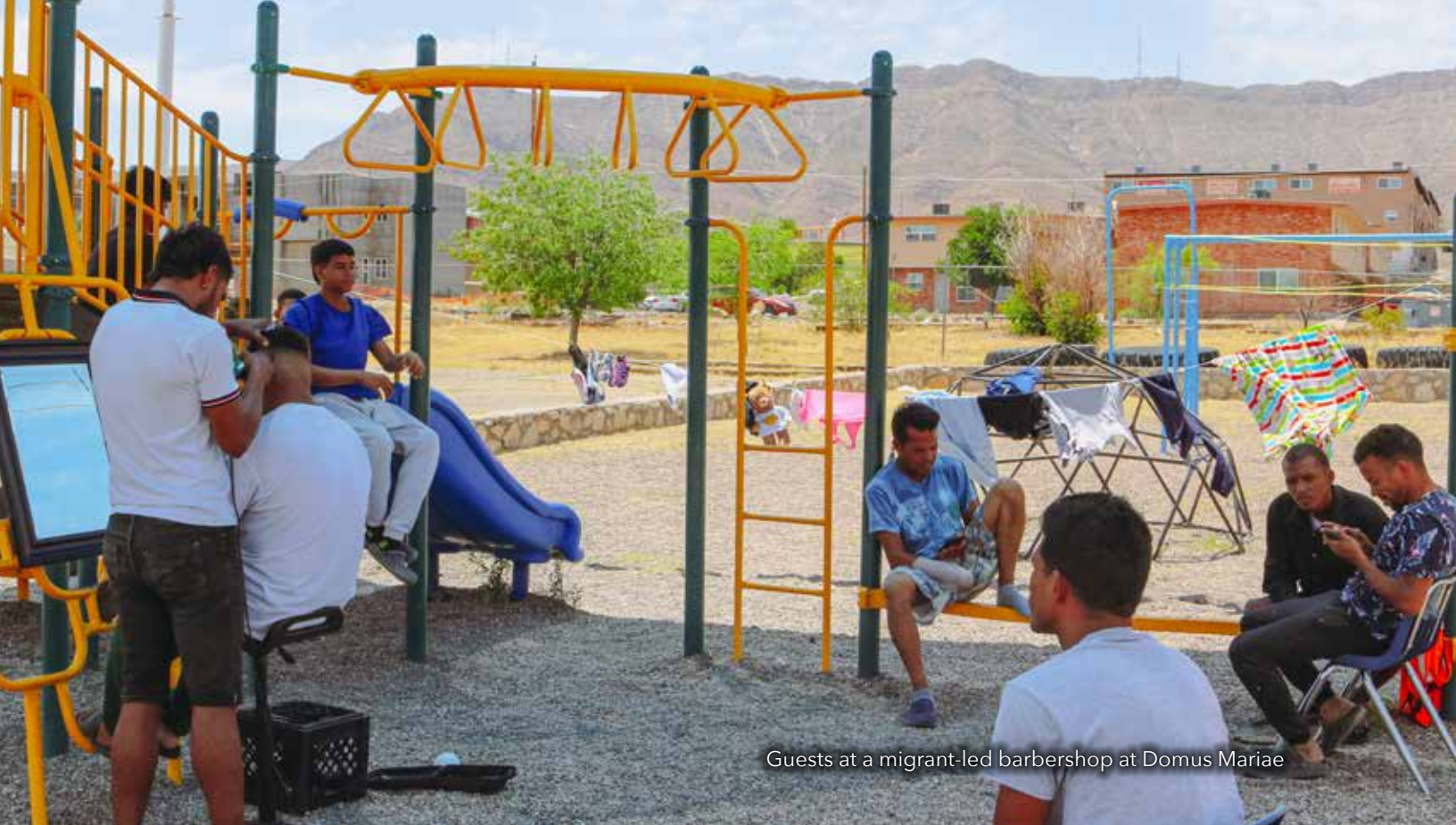
Guests at a migrant-led barbershop at Domus Mariae

negotiate the legal complexity of asylum cases. Border communities are the first witnesses in the U.S. as to what these challenges entail for migrants, but also for communities and organizations accompanying them.