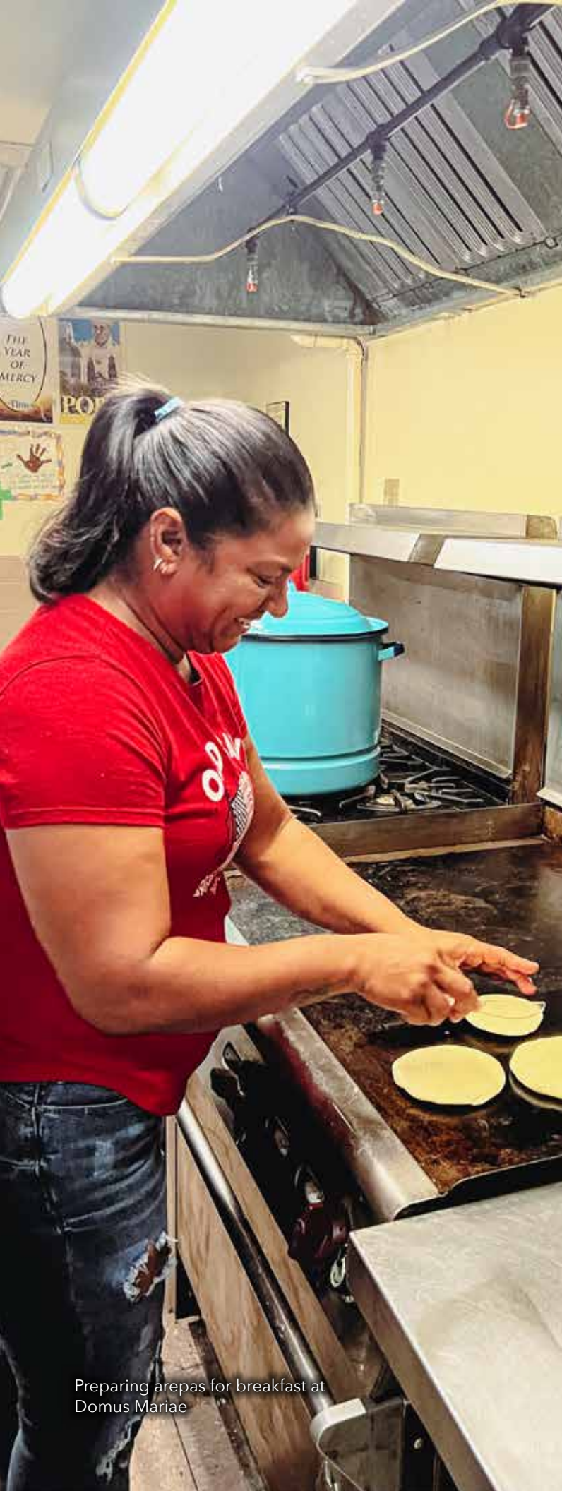
Preparing arepas for breakfast at Domus Mariae