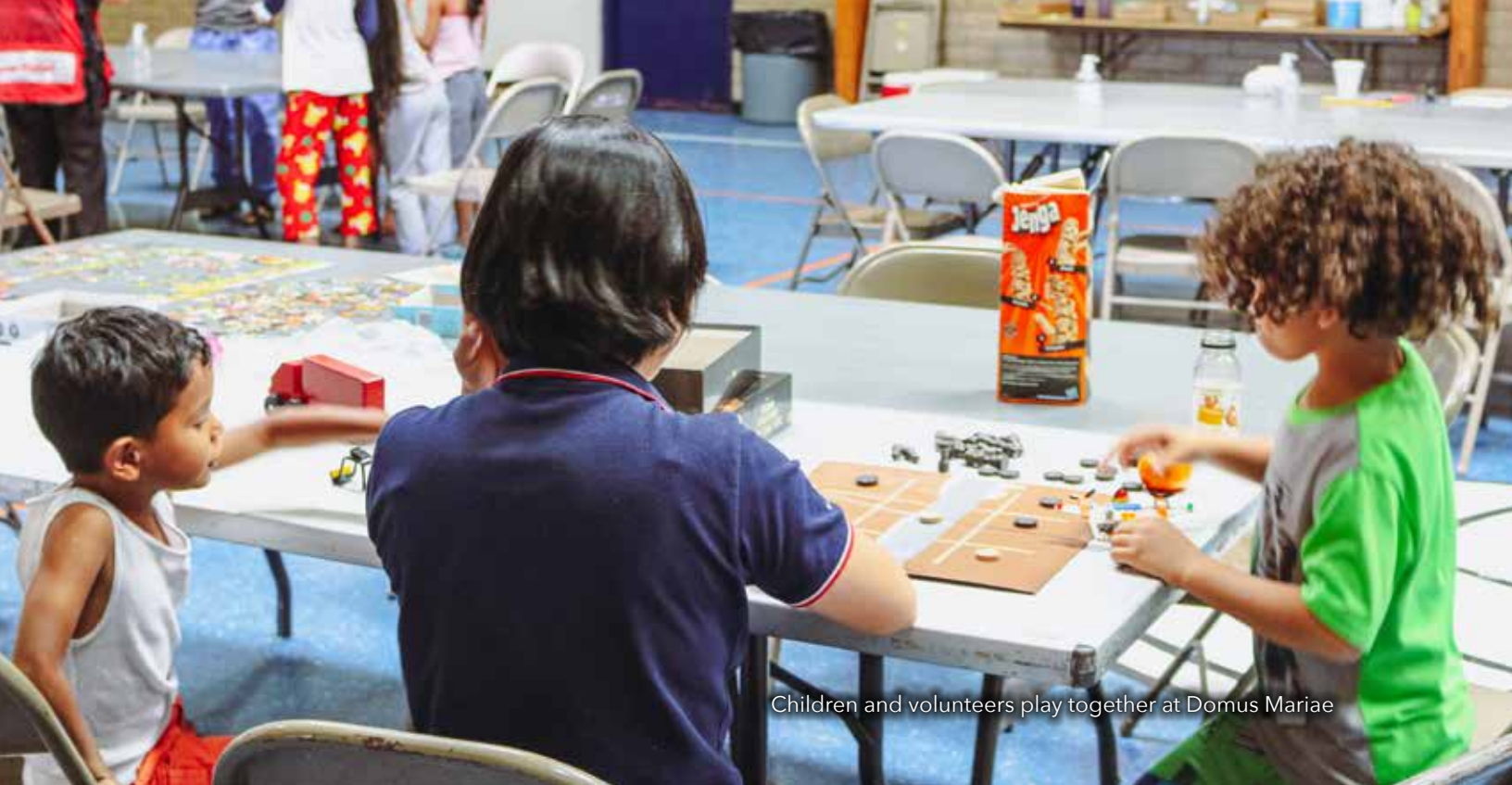
Children and volunteers play together at Domus Mariae

solve any questions they may have. Families will also take other relevant non-disclosable information with them, such as medical records from the checks doctors might have conducted in border communities. In that case, doctors can upload the clinical records of patients to the mobile application Vermidoc™, a cloud-secured app that allows people to access their records confidentially and show them to other doctors in their destination communities.