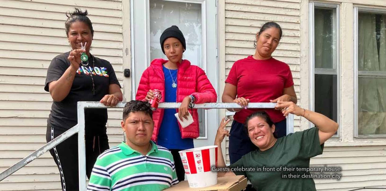
Guests celebrate in front of their temporary house in their destination city

in the 'financial component' calculus to grant parole. At the same time, DHS must also expand the time period by which the parole is granted because the current processing times for EADs are outpacing parole's validity. Currently, some paroled persons are receiving their EADs once their parole time has already expired.